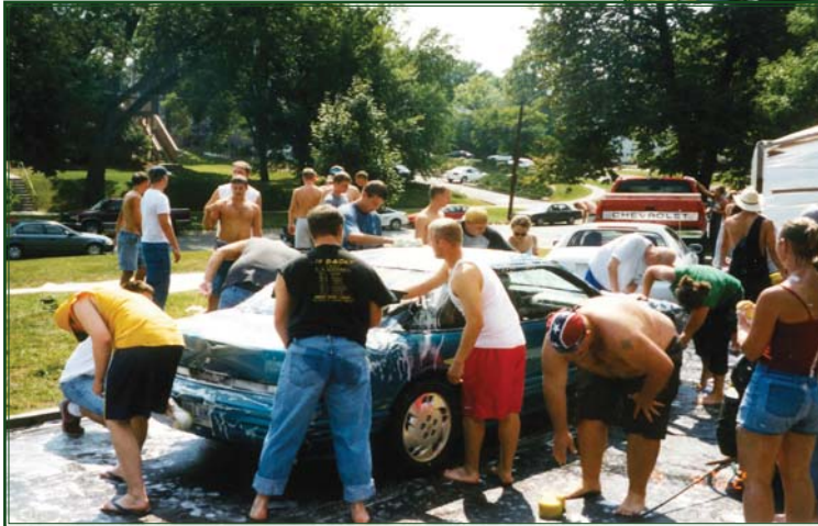
Hillbilly car wash, 2002 1st philanthropy- each fall